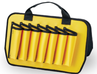
B121 Pallet included with B220 Shoulder Bag